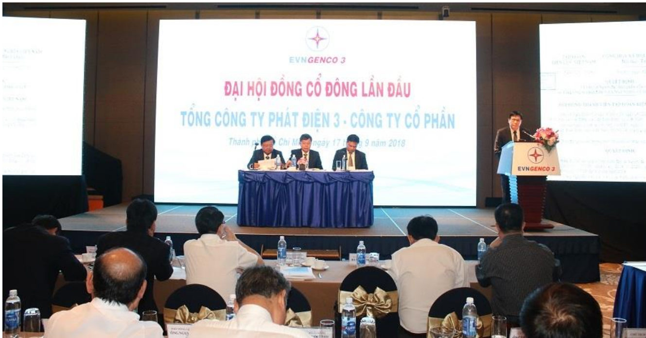
The presidium control the Congress

At the AGM, EVNGENCO 3 present summary report on the Equitization, shareholders participated in discussion, voted Charter, Business plan 2018 and plan of restructuring, salary plan of BOD and Supervisors in 2018, selecting the Auditor of the 2018 Financial Report, Draft regulation on internal management.